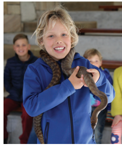
City of Newcastle

Catch the route 21 to Parnell Place – it's around a 250m walk to reach the fort. Jump on the route 21 from Broadmeadow Station, Hamilton, Merewether or the Junction. Alternatively you can use the routes 11, 13 and 14 to connect with the route 21 at Customs House.