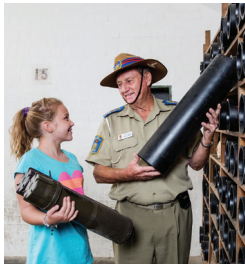
City of Newcastle

The route 21 stops right out the front. Jump on the route 21 from Broadmeadow Station, Hamilton, Merewether or the Junction. Alternatively you can use the routes 11, 13 and 14 to connect with the route 21 at Customs House.