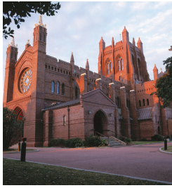
City of Newcastle