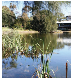
Hunter Wetlands Centre

Catch the route 25 to Orchardtown Rd or the route 26 to Carnley Ave before Orchardtown Rd and take the Tall Trees Walk off Freyberg St. Catch the route 11, 13 or 26 to Lookout Rd opp Grandview Rd.