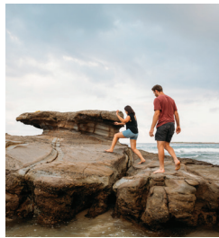
Lake Macquarie City Council

Catch the route 47 to get there – it's less than 500m walk from the bus stop on Marton St to enjoy a few hours in nature. You can connect with the route 47 at Hunter St at National Park St or use the routes 11, 12, 23 or 24 to connect with the route 47 at Jesmond.