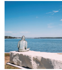
Lake Macquarie City Council

Catch the route 14 from the city, Kotara, Charlestown or Belmont. You can use the routes 11, 14, 22, 25 and 28 to connect with the route 14 at Charlestown or the routes 41, 43 and On Demand services to connect with the route 14 at Belmont.